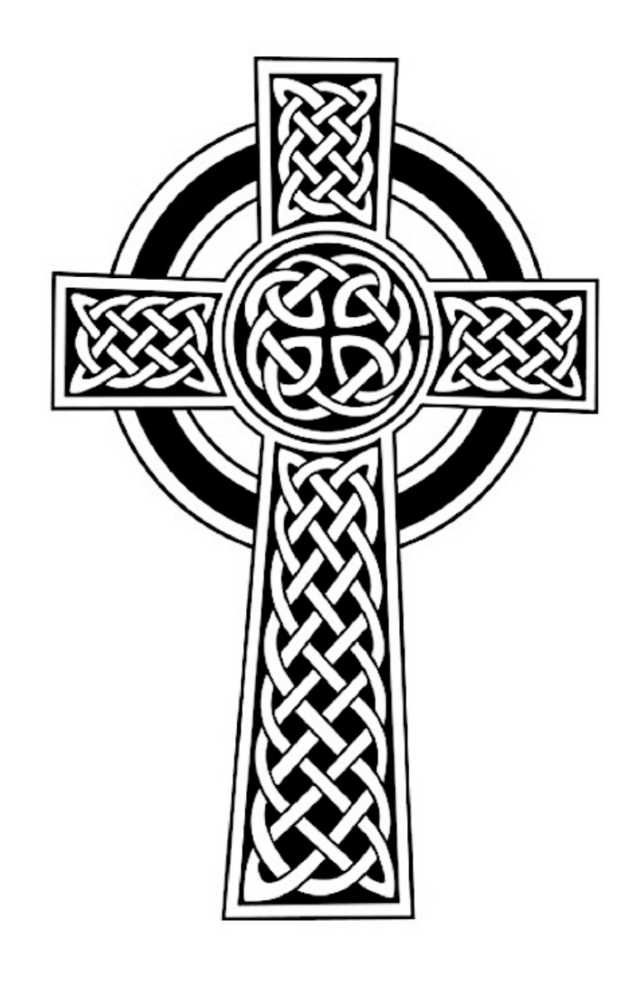
The Holy Eucharist: Rite Two Day of Pentecost with Sacrament of Holy Baptism June 8, 2025 at 10:30 a.m.